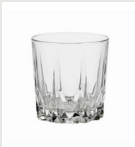
Pasabahce DOF Tumbler (300ml)