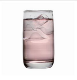
Arcoroc Vigne Hi Ball (290ml)