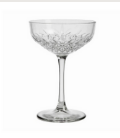
Pasabahce Timeless Coupe (270ml)