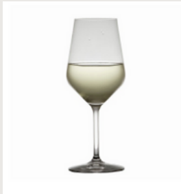
Stolze Revolution Wine Glass (490ml)