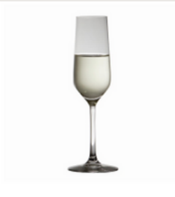
Stolze Revolution Flute (200ml)